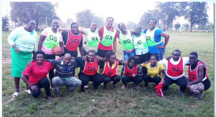
KUSU (Green) and KUDHEIHA (Red) Netball Teams