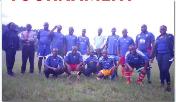
SACCO Football Team