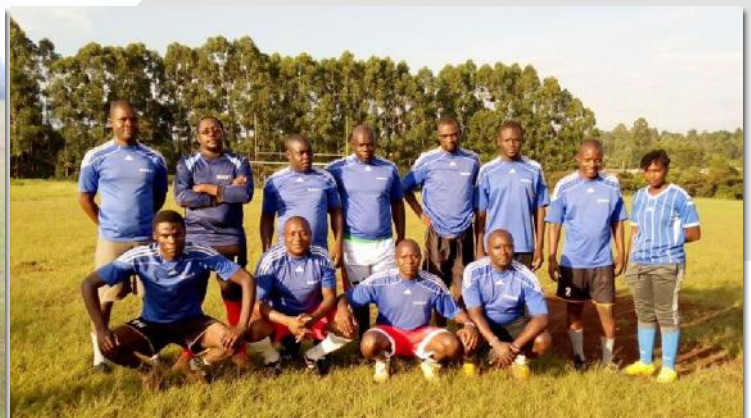
KUSU Football Team