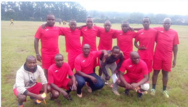
UASU Football Team