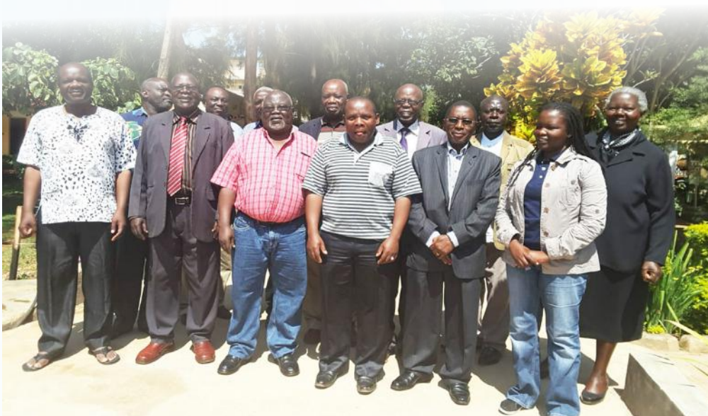
MMUST Professors during the Professors Retreat at Farmview Hotel, Busia

MMUST has eighteen (18) professors comprising of two female professors and sixteen male professors. The professors have a Professors Forum where they discuss on issues facing the University and how best they can play a role in growing the University.