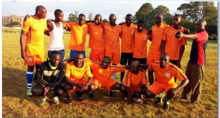
KUDHEIHA Football Team