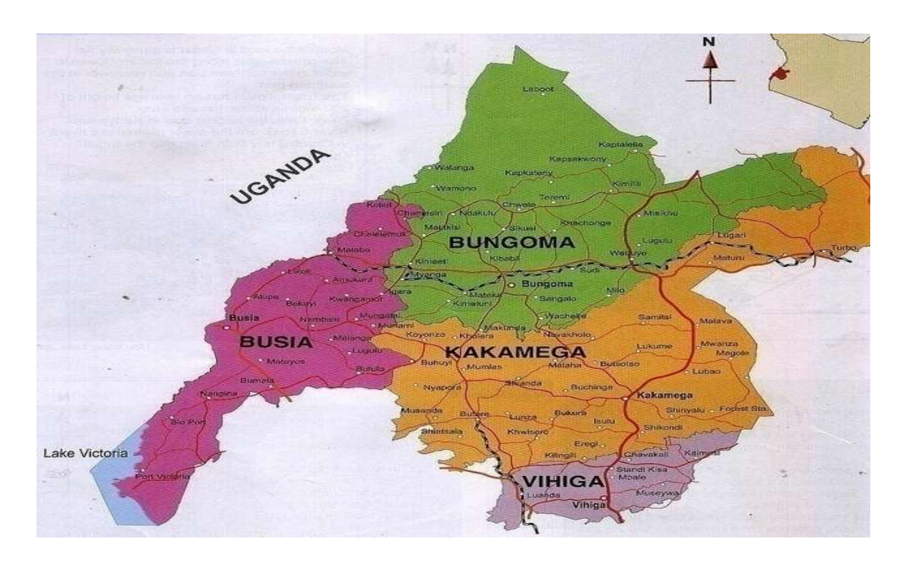
Figure 3.1: Bungoma County