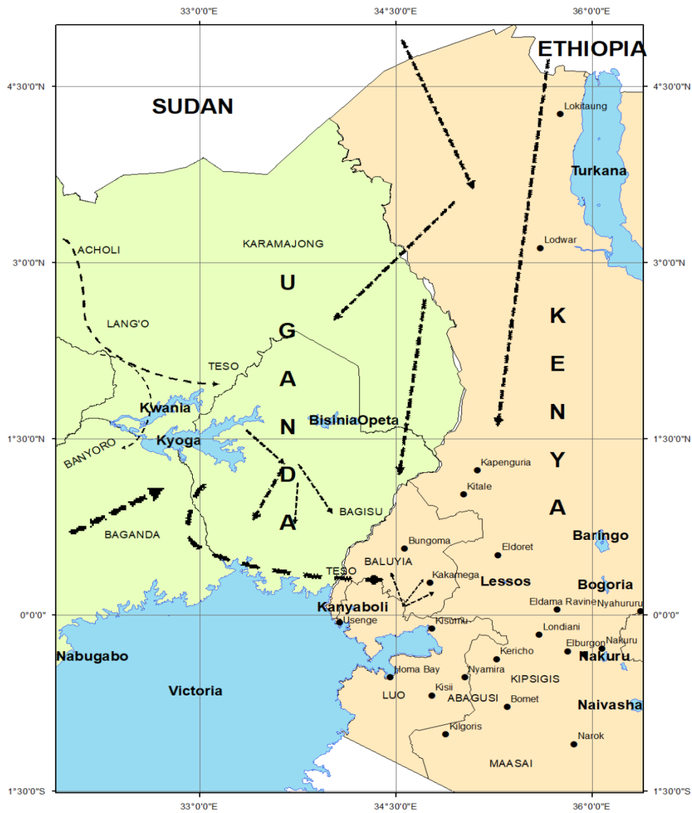
Figure 1. Migration Route of the Abaluhya People

under stress can respond by migrating or intensifying their agricultural production, which in essence changes the mode of production.