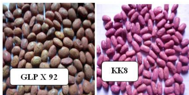
Fig.1. Common improved bean varieties grown in western Kenya