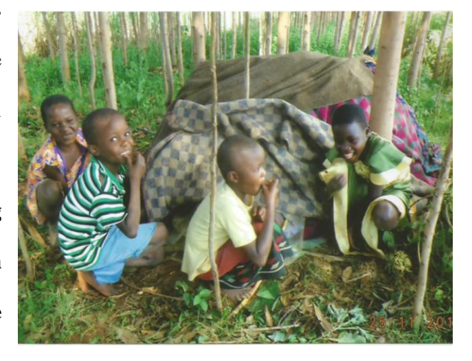
Plate one showing Children watching over the termite mound covered with blankets awaiting the harvest.

The songs sung during the harvesting reveal a lot on the female individual in the community especially in reference to the person of mother. Talking to Anastancia