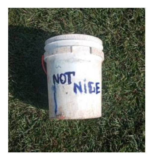
Figure 4. 20: "Not nice" label on a water bucket

Furthermore, a sense of rebellion was depicted by the label "not nice" that was also written on a water bucket as per figure 4.11.