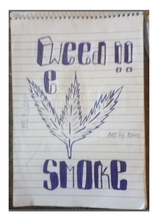
Figure 4.11: Drawing of a cannabis plant

The researcher engaged in observing the labels and drawings created by some learners in the school section of SBI. This involved going round the SBI premises from time to time, over a 10 weeks' period. The main observations were that drawings and labels were created in secret and in places such as walls, desks, books, on the blackboard, on clothes, on shoes, on buckets, and even on the body. Also notable was that most drawings and labels depicted themes of drug use, pornography, and gun violence, as evident in this section. A prevailing component in the drawings and labels was the theme of drug use. One of the learners drew the picture of a leaf with three branches and scribbled the words "weed!! Smoke" as indicated in figure 4.2.