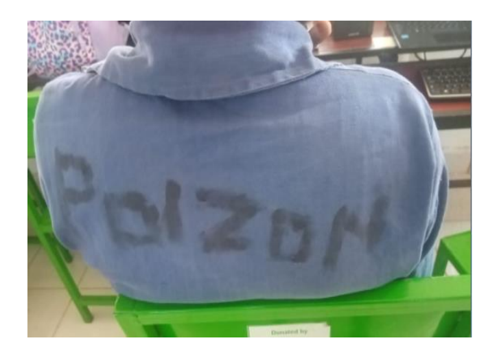
Figure 4. 18: "Poizon" label on the uniform

Nevertheless, also notable from the drawings and labels was a theme of rebellion. One learner created the label "Poizon" on his shirt as depicted in figure 4.9.