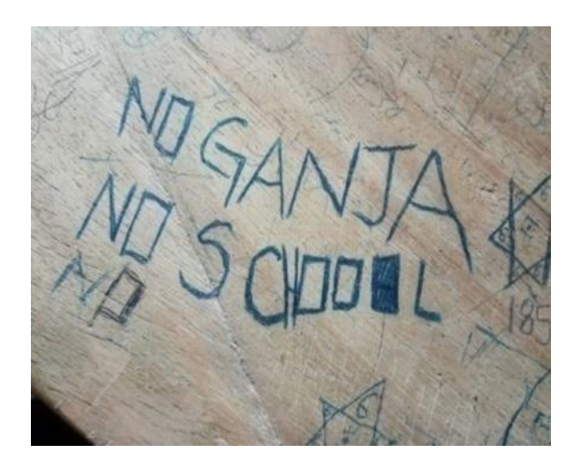
Figure 4. 12: Label with the words "no ganja no school"

The drawing of a cannabis plant with the words "Weed!! smoke" suggests that the learner was depicting substance use, specifically marijuana (cannabis). The inclusion of the word "smoke" indicates an association with the act of smoking marijuana. This drawing reflects their awareness of illicit substances and possibly their exposure to such behaviour. Another learner created a label with the words "no ganja no school" as indicated in figure 4.3.