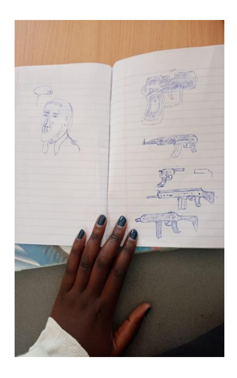
Figure 4.14: Drawing of 5 gun rifles on an exercise book

Another learner drew pictures of five gun rifles on an exercise book as depicted by figure 4.5.