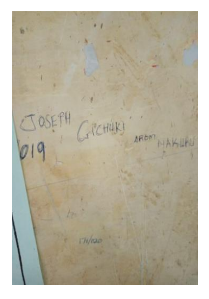
Figure 4. 16: Label 1 of identity affirmation

A theme of identity affirmations was also notable from some of the labels created. One learner created a label with his name "Joseph Gichuki From Nakuru 019" (figure 4.7).