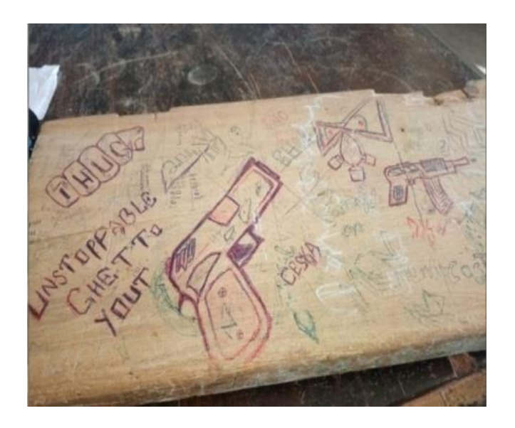
Figure 4. 13: Drawing of a pistol gun and another rifle

Also emerging from the drawings and labels was the theme of gun violence. Another learner created a drawing of a pistol gun and within the drawing was another rifle and words such as "unstoppable ghetto youth" and "thug" as indicated in figure 4.4.