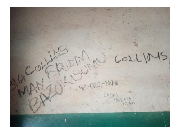
Figure 4. 17: Label 2 of identity affirmation

In a similar label, another learner wrote down his name and where he hails from' "Big Collins man from Bazo Kisumu" as per figure 4.8.