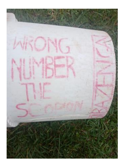
Figure 4. 19: "Wrong number the scorpion" label on water bucket

The phrase "wrong number the scorpion" written on a water bucket appears cryptic and metaphorical. While the exact meaning behind this phrase is unclear without context, it suggests a sense of rebellion, mystery, symbolism, or possibly even a metaphorical message. This kind of expression might indicate a desire for intrigue, a wish to convey a deeper message, or a need for attention. It could also reflect creativity and a penchant for abstract or poetic expression.