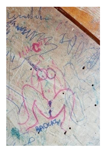
Figure 4. 15: Drawing of a naked woman's body

The observation findings also indicated an emerging theme of pornography from the drawings and labels. One learner drew the body of a naked woman, clearly highlighting their private parts, as indicated in figure 4.6.