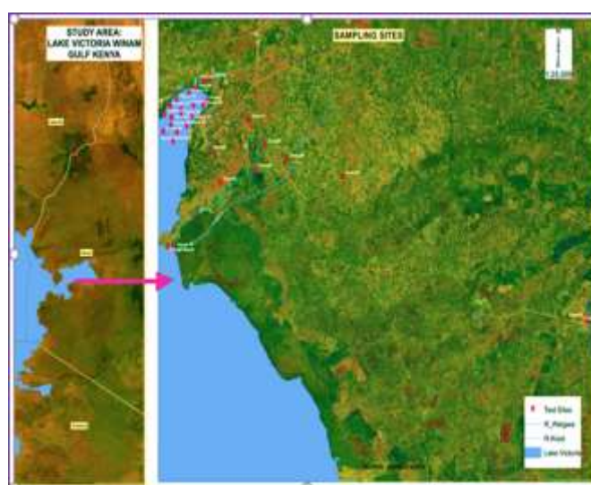
Fig 1: Location of Winam Gulf in Lake Victoria, Kenya, showing the sampling sites Three replicates' samples water and sediment samples were collected from 31 sampling and placed in sterile plastic bottles (500 ml) that and transported to the laboratory in cooler boxes (4°C) within 12 hours and stored at -80°C for laboratory analysis.

Sampling design and collection: Purposive sampling was used so as to obtain the maximum range of heavy metals from the sediment and water samples collected from fifteen different sites in the gulf. Sampling was carried out at the flood plains of the inlet rivers, the Kisumu wastewater treatment plant's (WWTP) effluent discharge into the lake, Kisumu industrial effluent, fish landing beaches, storm water entrance points, the Kisumu Water and Sewerage Company (KIWASCO) treatment facility. Sediment and water samples were collected from various sampling sites from the lake, KIWASCO effluent, River Kisat and River Nyando (figure 1).