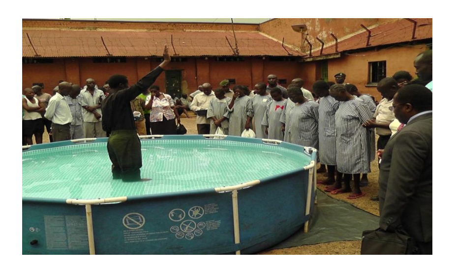
Figure 1: Inmates ready for Baptism

Going by the views of the respondents elicited during the interviews, it can be concluded that there were programs in the prison that were aimed at transforming lives. A photo taken on the 16<sup>th</sup> of March 2017 supported this view especially considering that Christian teachings culminated into a baptismal ritual. Figure 1 below shows inmates who were ready to be baptized after a period of spiritual teachings in the prison.