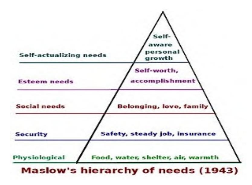
Figure 2: Maslow's Hierarchy of Needs Model