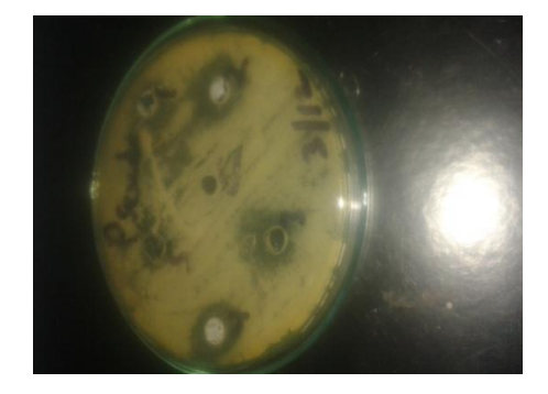
Fig. 2. Bioactivity of extracts for against MRSA (Kirby-Bauer disc sensitivity method)

Key: Amp: Ampicillin, Nyst: Nystatin, MeOH: (Methanol), EtOAc: (Ethylacetate); NI: No inhibition