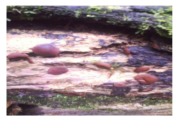
Fig. 1. Ganoderma lucidum from Kakamega, Kenya

Phytochemicals from Ganoderma lucidum mushroom species all over the world have been known to have medicinal properties and contain physiological active constituents [1-2]. For instance, G. lucidum is known to contain more than 100 types of polysaccharides showing strong immunomodulating activities [1-4]. The most vital phytochemicals have been triterpenoids with anti-inflammatory, antitumorigenic, hypolipidemic activities and [4-7]. Other compounds reported from Ganoderma lucidum include the isolation of various Ganoderic acids [8-9,10], esters [10], alcohols [11] and lactones [12]. So far, there are little reports on either chemical constituents or biological activity of Kenyan Ganoderma lucidum, and therefore this research work sought to investigate the chemical and antimicrobial activity of this species.