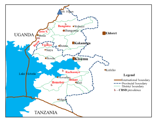
Figure 3. Map of Western Kenya showing the distribution of cassava brown streak viruses