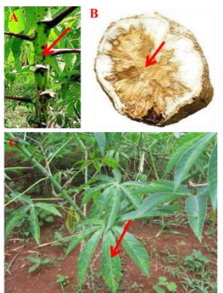
Figure 2. Symptoms of CBSD: A-Cassava stem with brown streaks, B-Cassava tuber with hard brown corky rot and C- cassava plant with mottled appearance. ( Picture taken in Matayos, Busia )

on the cassava cultivar encountered. Nyakatinegi cultivar showed mild foliar symptoms although tubers had constrictions and relatively higher root disease severity. Some cultivars for instance Selele cultivar was severely affected by the disease. Cassava brown streak disease expressed as an irregular yellow blotchy feathery chlorosis which was more pronounced on lower mature leaves as in (Figure 2).