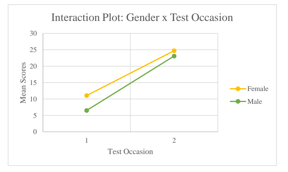
Figure 1. Repeated Measures AN