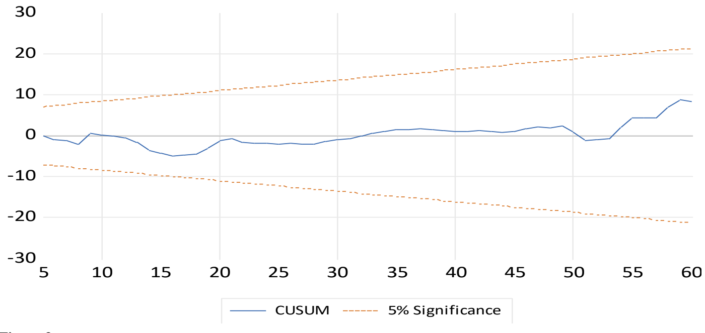
Figure 3 CUSUM Test

A stable model should lie within the upper and lower limits of the 0.05 level of significance. To assess the fitness of the model obtained, a cumulative sum test (CUSUM) was undertaken. The CUSUM test enables more robust estimations and provides more information about a model (Talas et al., 2013). Figure 3 below indicates that all the variables lie within the 5% significance level both at the lower and upper boundaries. This clarifies that the regression model employed for analysis was fit and stable in the study.