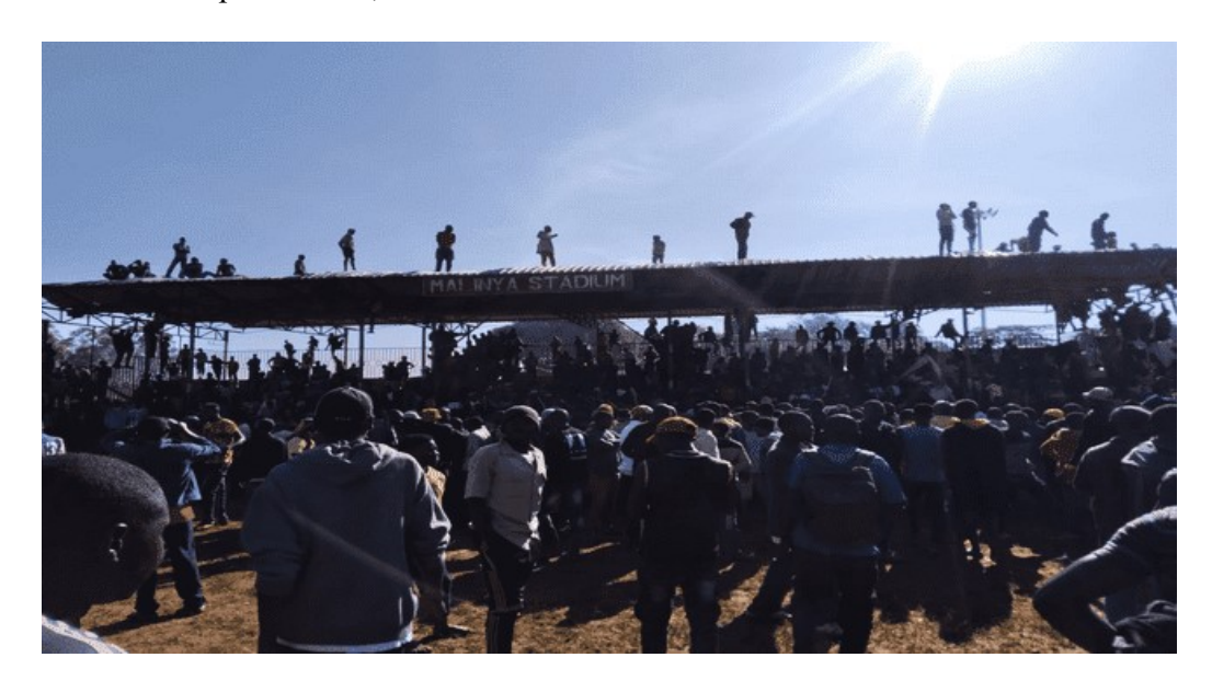
Plate 9: Showing fans in a bullfighting arena-Malinya

Furthermore, with the existence of county government, it has been witnessed that, bullfighting stadia have been constructed in order to support the activity fully as shown in the plate below;