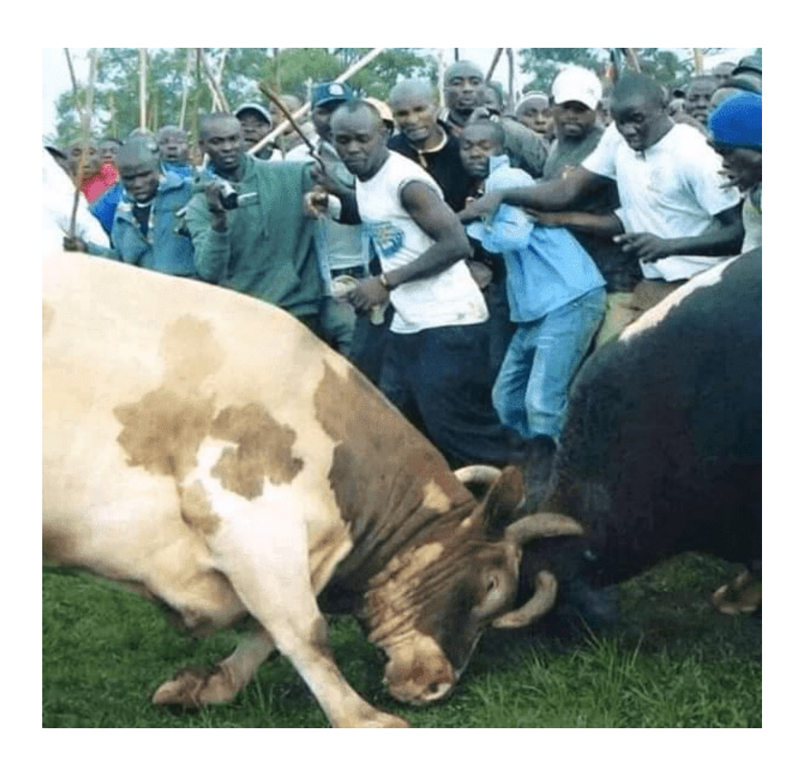
Plate 3: Showing how the community embraces bullfighting

On the bullfighting day, there are three items that are seen: Isukuti, shisiliba (whistle) and African ritual rods. The rods used during bullfighting include: Lusui, lisibwa and Lutari (African traditional rods believed to have cultural purposes). In this case, lusui is dioecious where the male one is the one used in bullfighting and specifically for men, while the female one can be used for other purposes such as grazing animals etc. The lusui and lusibwa are used by the people around the bull. Herbs are put on them to protect the bull, bring victory, and block bad omens. The