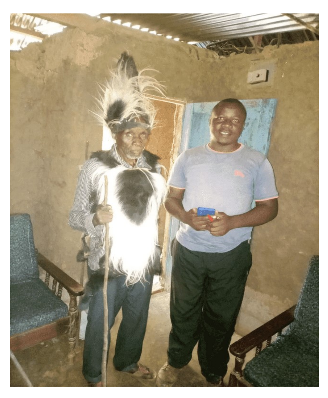
Plate 12: Showing a bull owner and the researcher

Comparatively, for rugby fanatics, Saturdays are meant for the rugby game. For the married ones, the weekend is a fun-filled family outing day, while for a number of Kakamega county residents; Saturdays are amazing, more so when it starts off with bullfighting contests.<sup>645</sup> For these bullfighting lovers, they begin their day by flocking