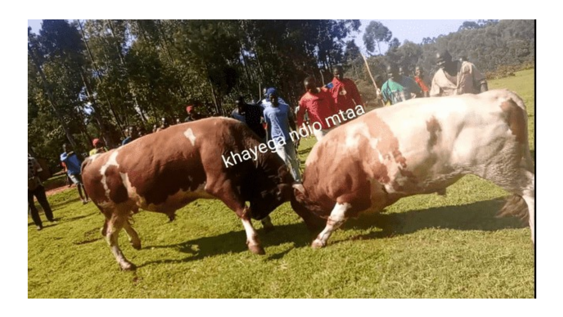
Plate 1: Showing how bulls locking horn among the Abakakamega

From Justus Isalambo's argument, this study found out that, unlike the festival in Spain which involves a fight between a bull and a matador (a human fighter), the Kenyan bullfighting festival is a meeting between bulls as shown in the figure below. Human beings in this context only play the role of catalyzing the bulls, to cheer and to celebrate the winning animal. Furthermore, it's not about two bulls coming to fight but rather two different villages or clans or even communities coming to measure their strength, bravery and skills. Additionally, Ambeyi adds that, the characteristic of the often well publicized festival is that before, during and after the actual bullfight, there is extensive singing and verbal exchanges between the "bull drivers" from the opposing sides. The very fanfare that accompanies this fete leaves one wondering what is really in it as shown in the plate below. It shows how bull locks horns among the Isukha and Idakho people.<sup>365</sup>