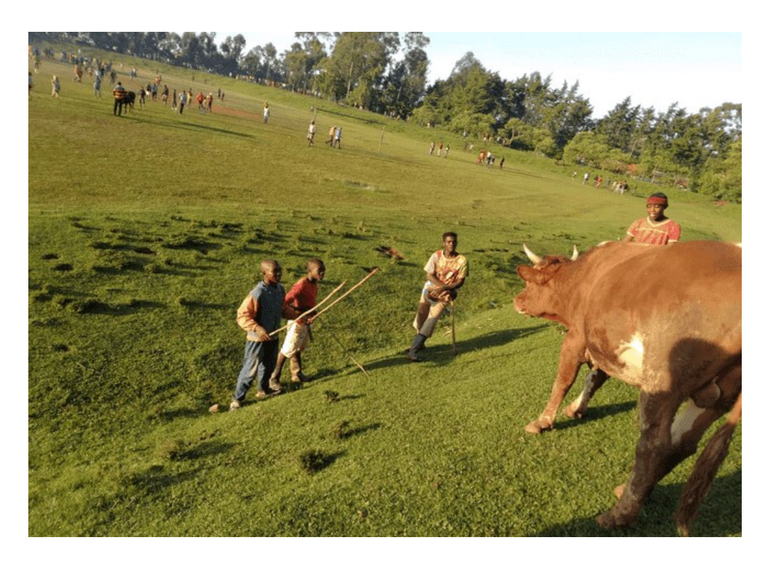
Plate 7: a photo showing young boys training a bull on how to fight by watching others fighting