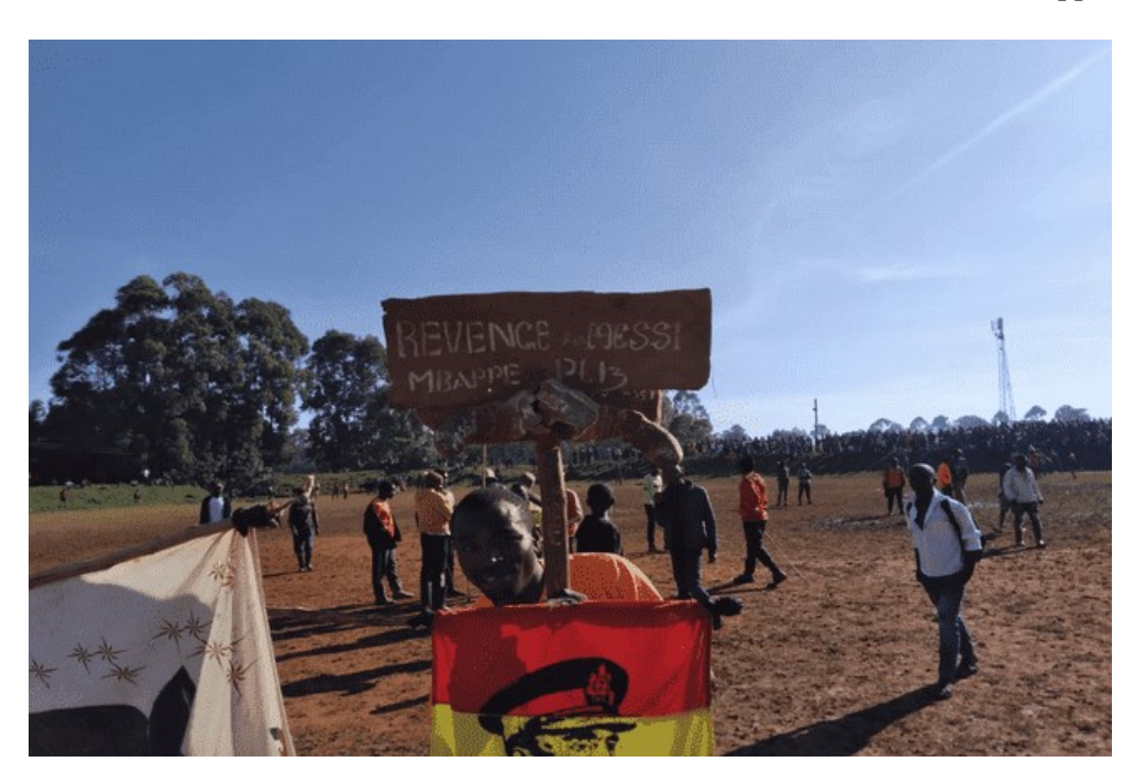
Plate 5: Showing a name of a bull that died

On a wood in form of a cross written on "REVENGE for MESSI MBAPPE please" on inquiry on what it meant, Geofrey informed this study that it was an expression of culture in representation of two bulls (one that died and another one that was alive, and took up the war of the one that died). In this case, Messi (Named after a prominent footballer) died and Mbappe (Named after another prominent footballer) came in to take over from where Messi had left the high-level competition with several victories.<sup>418</sup>