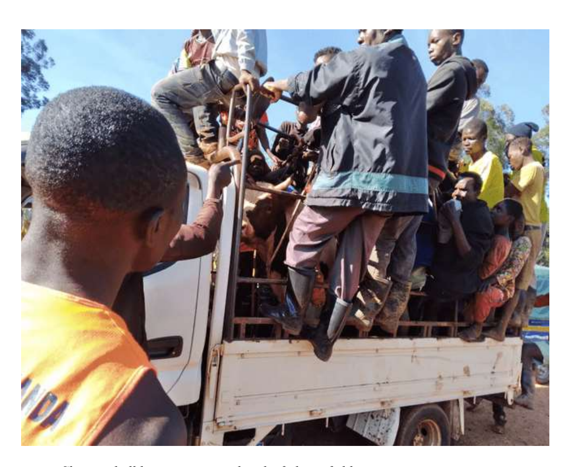
Plate 6: Showing bull being transported to the fighting field

Upon arriving at the stadium, the organizers set the bulls in different corners ready to fight as planned depending on the size of each animal. Unlike other formal sports where supporters have their designated areas to watch from; among the Abakakamega, the cheering crowd shares the pitch with the fighting bulls. Face to face, the bulls seize each other up before launching into each other. Abakakamega to will only be declared the winner when it defeats its opponent by chasing it away. The isukuti dance will break out again to symbolize victory by the residents from where the champion bull comes from. All the villagers will surround the winning bull as they escort him back home amid celebrations and song.