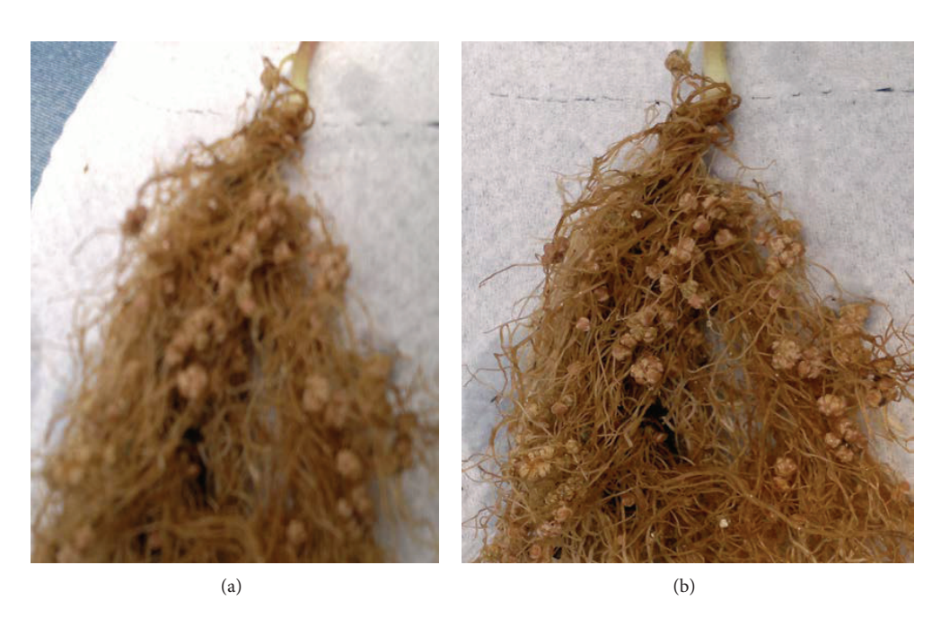
FIGURE 1: Sample nodules formed by isolates from Kisumu (a) and MMUST (b).

of soil had higher levels of N in the soil. Soils from farms in Kisumu were characterized by low aluminum (Al) and copper (Cu) but had high populations of native rhizobia than MMUST farms. Available P ranged from 12 ppm to 62 ppm and 6 ppm to 11.8 ppm in cultivated farms and uncultivated land, respectively. Soil texture was classified as clay and sandy loam for MMUST and Kisumu, respectively.